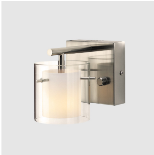
matt opal + shiny satin